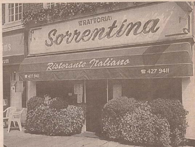
Relaxing and comfortable surroundings make for an enjoyable dining experience

This restaurant was awarded the Heartbeat Award eight years ago, for the healthy options on the menu, which pleasantly proves that not all Italian food is stodgy and starchy, as the chefs have updated and introduced new modern ideas to the menu, complemented